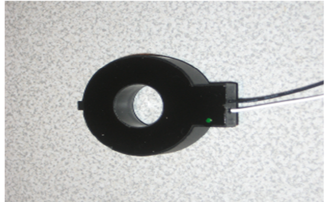
Solid Ring CT Current Sensor